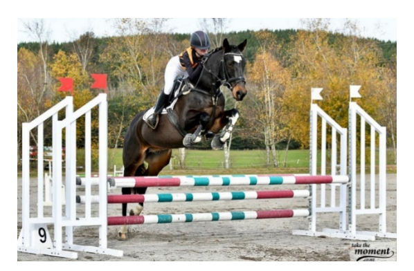
Toni & Circle K Spot On