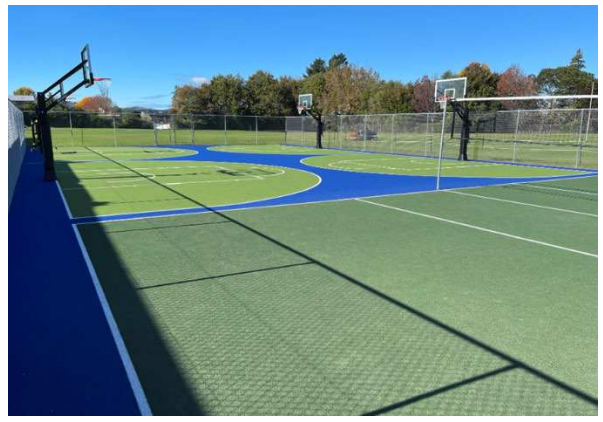
New turf with basketball hoops & volleyball court