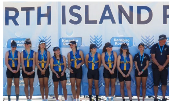
Girls Intermediate 8