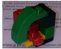
Child Abuse Reporting Toy

Year 9 students had a week with a difference, focussing on the future and the skills they need to get the most out of Year 10. One challenge which showed team work, problem solving and innovation, was the Lego Challenge. Winning designs included solutions to child abuse, starvation and the housing shortage.